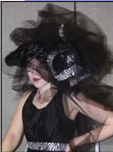
Model Prepped by SWAT Team

all the applicants have been interviewed the new Team will be chosen and you will start your exciting year as a SWAT Team member.